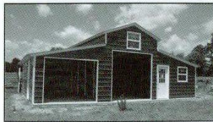
Horse Barn with customer supplied doors and windows